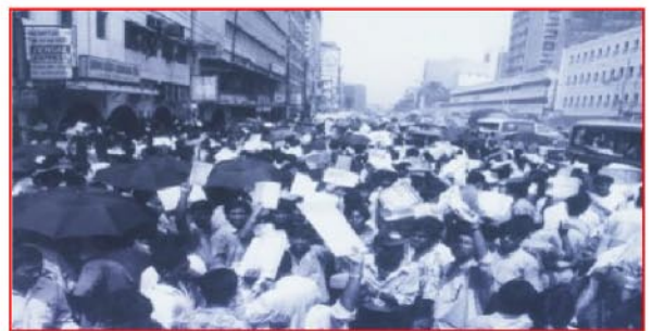
Share trading in the street outside the exchange